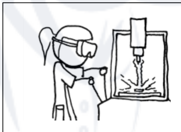
Improper use of equipment