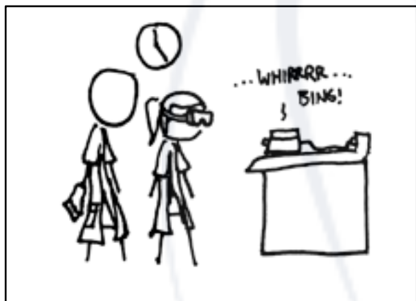
Lack of PPE